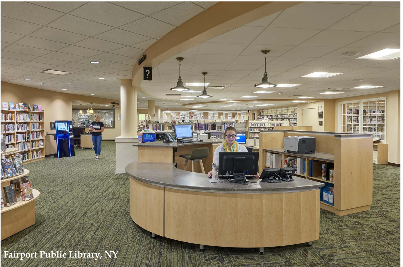
Fairport Public Library, NY