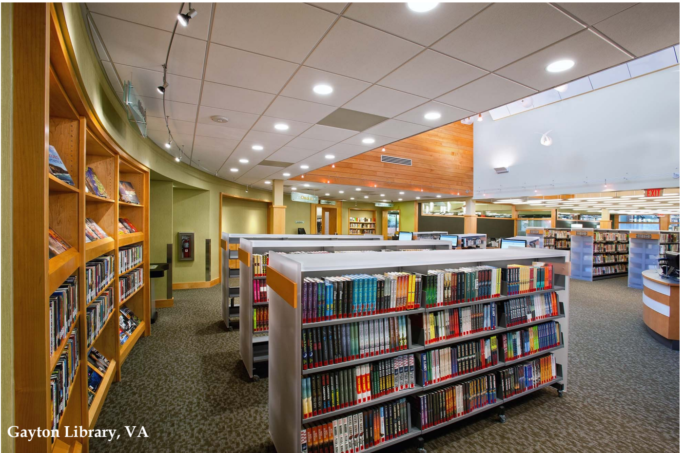
Gayton Library, VA