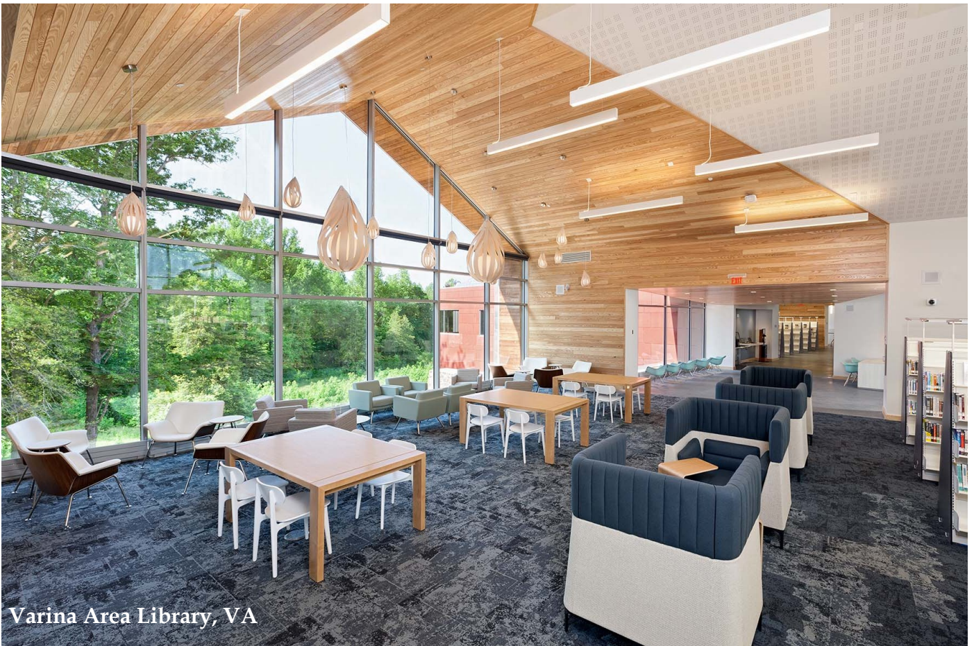
Varina Area Library, VA