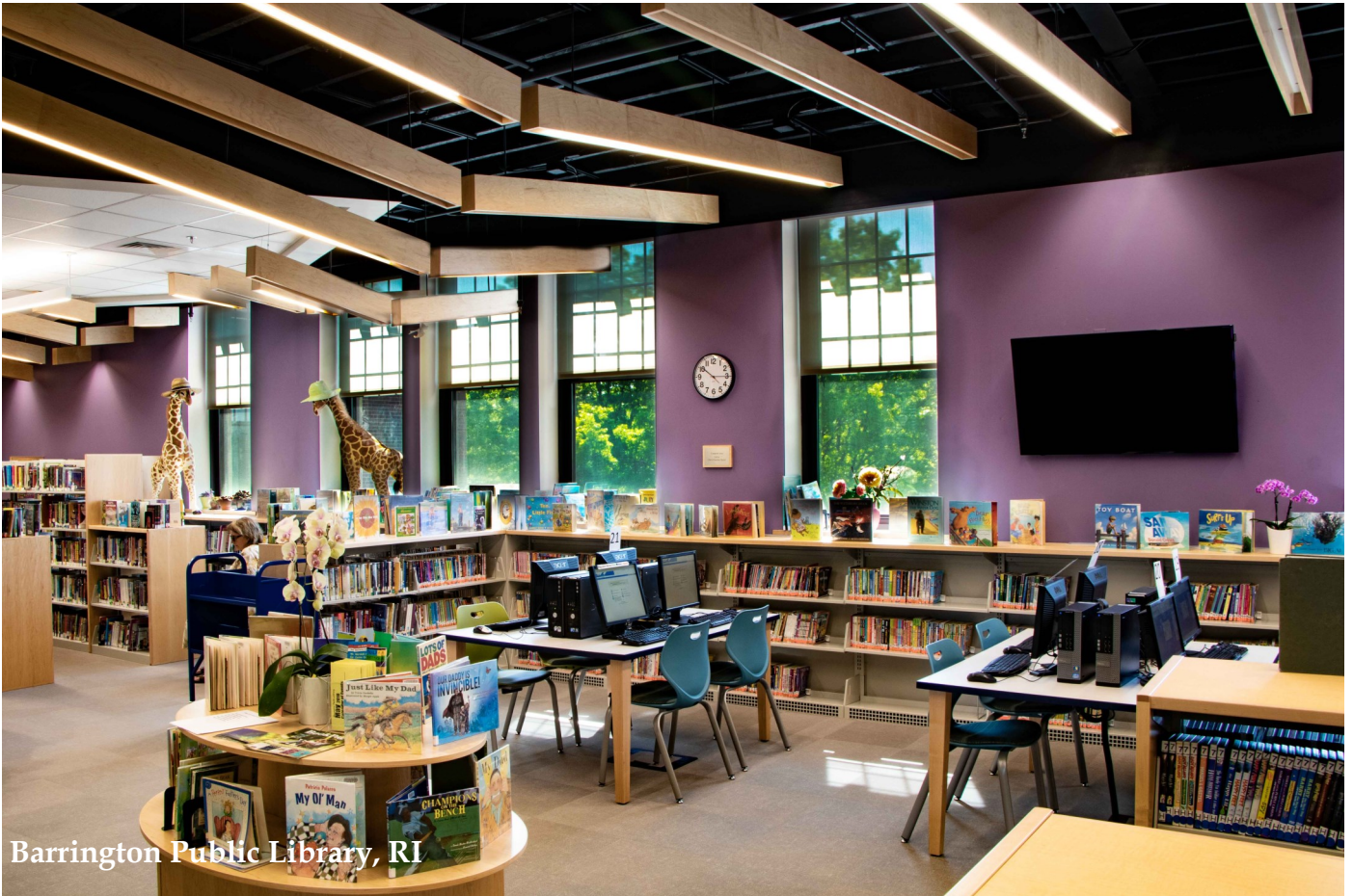
Barrington Public Library, RI