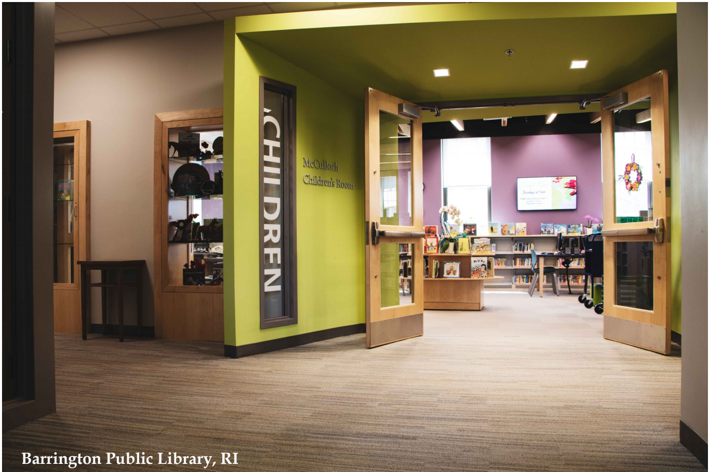
Barrington Public Library, RI