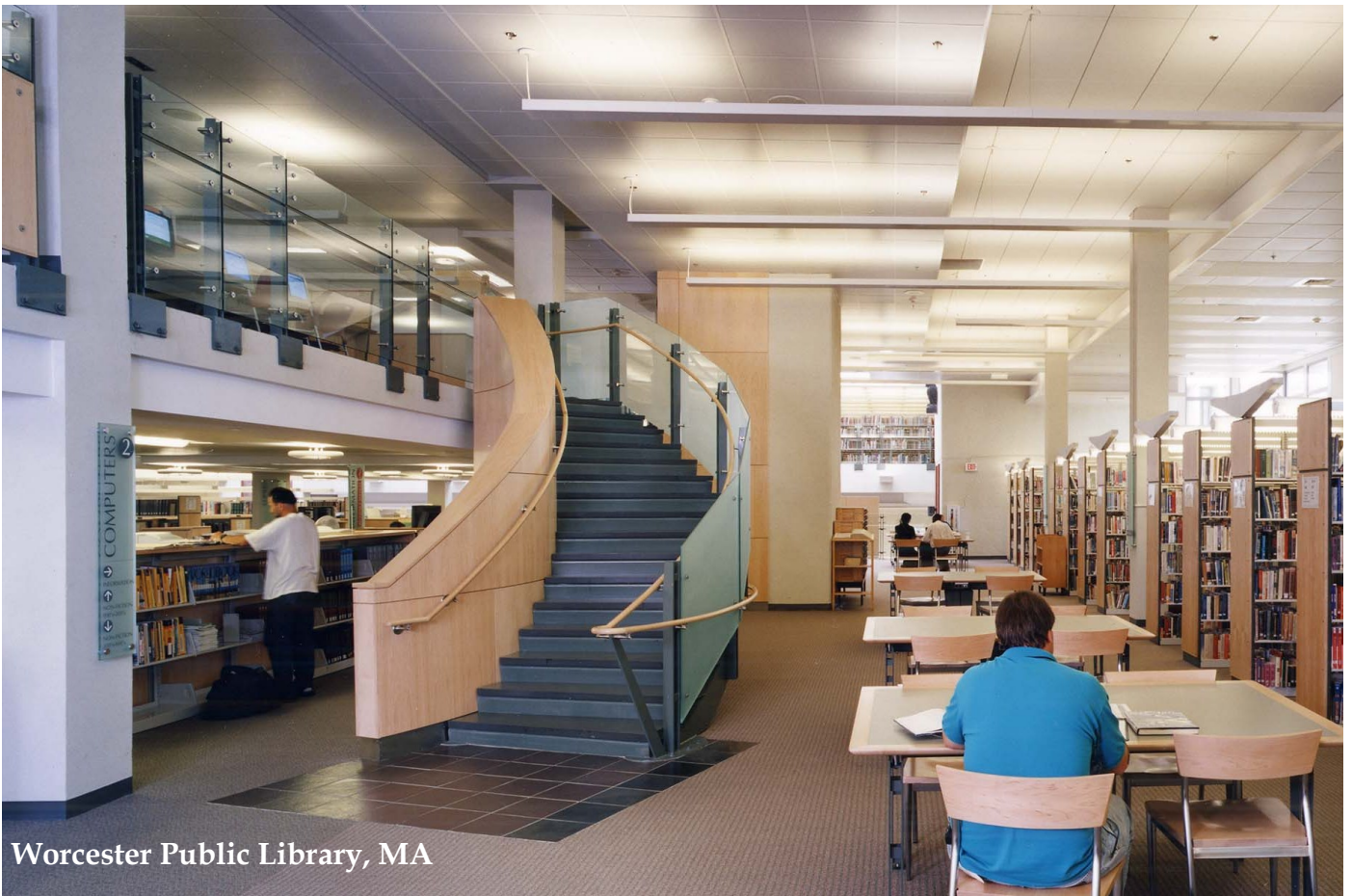
Worcester Public Library, MA