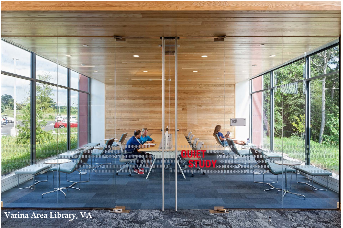
Varina Area Library, VA