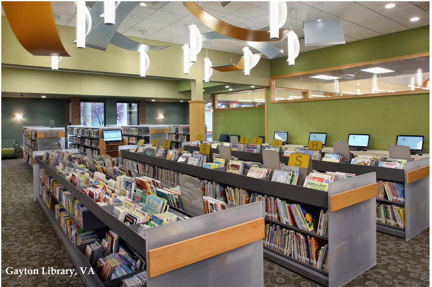
Gayton Library, VA