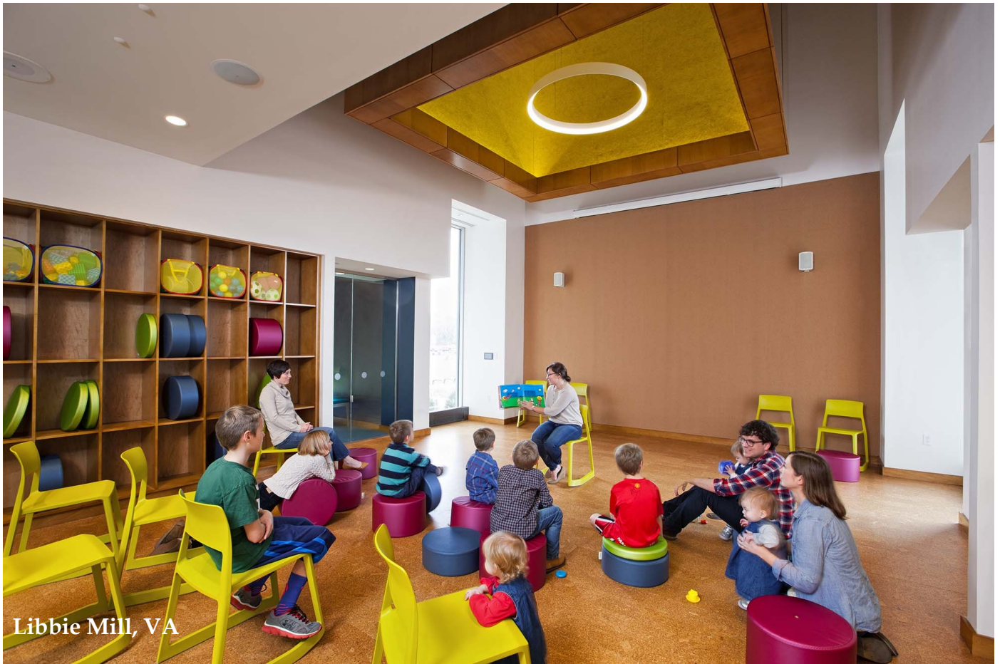
Libbie Mill, VA