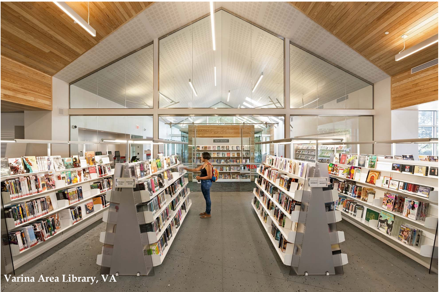
Varina Area Library, VA