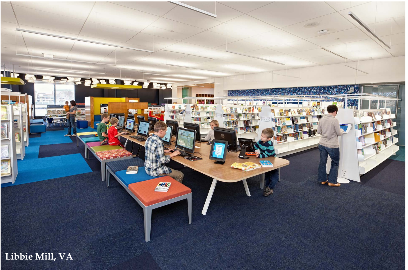
Libbie Mill, VA