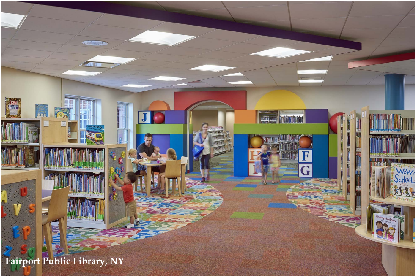
Fairport Public Library, NY