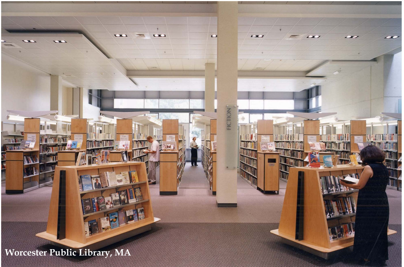
Worcester Public Library, MA