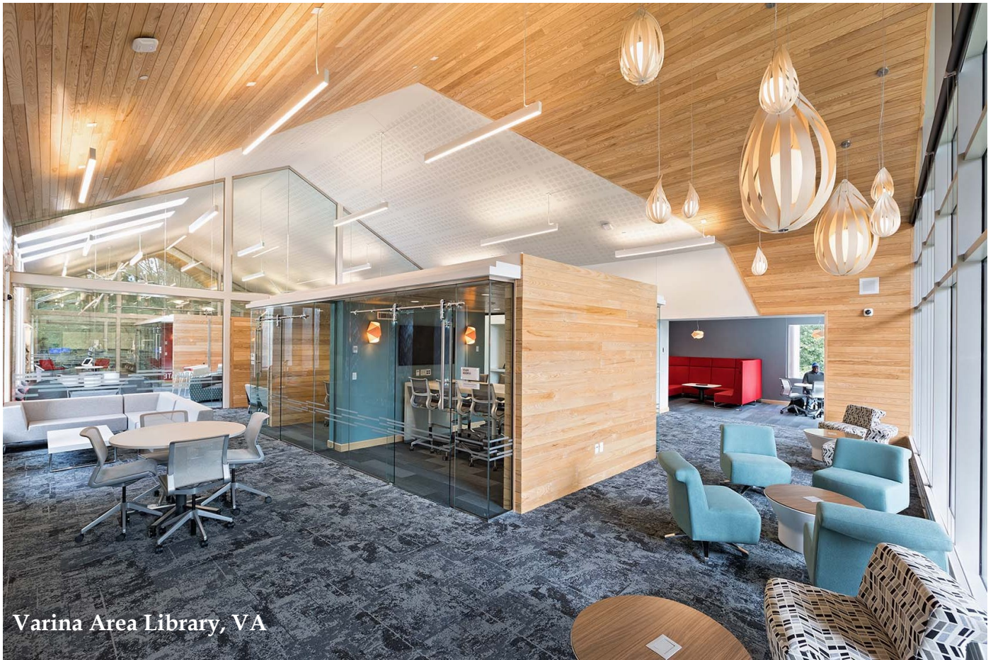
Varina Area Library, VA